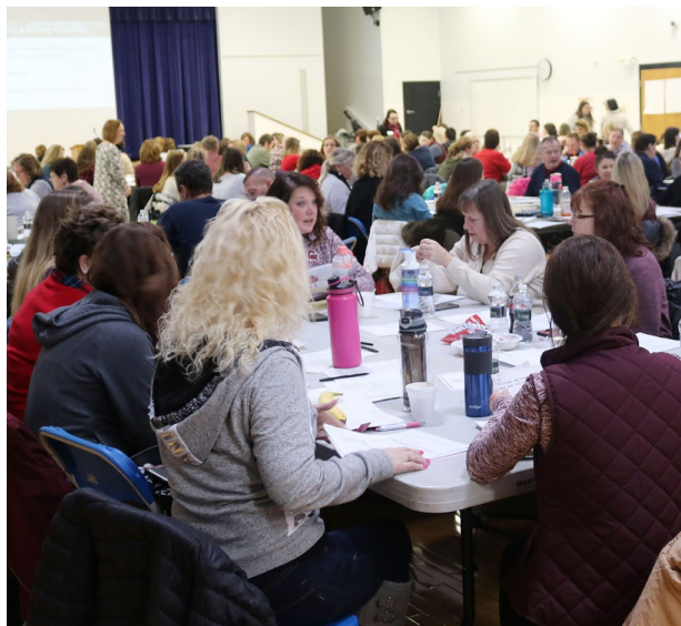
A crowd of third-grade educators, administrators, reading coaches and more meet in Phoenix for an Oswego County Literacy Initiative event.

More than 700 educators attended winter Oswego County Literacy Initiative (OCLI) events around the county, with presenters showcasing different techniques to help children in their quest for language proficiency.